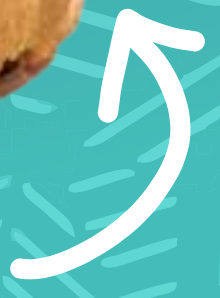
Crumbed Gallo BBQ Sub