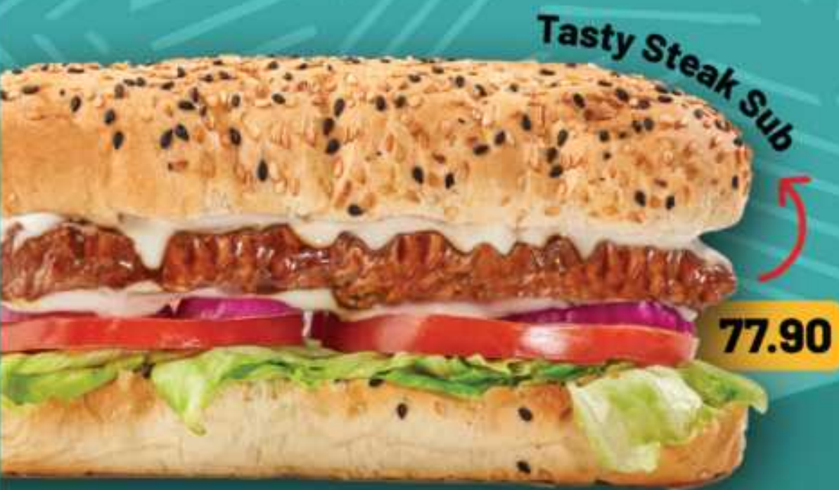
Tasty Steak Sub