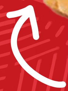
Tasty Steak Sub