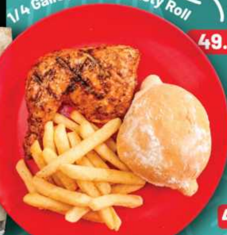
1/4 Gallo, Chips + Tasty Roll