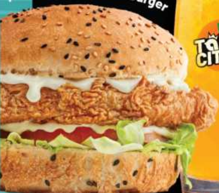
Crumbed Gallo Burger