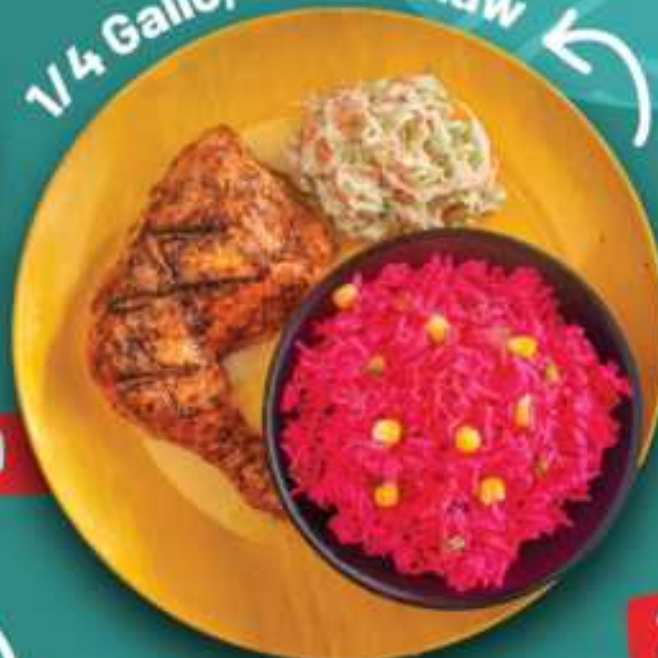
1/4 Gallo, Rice + Slaw